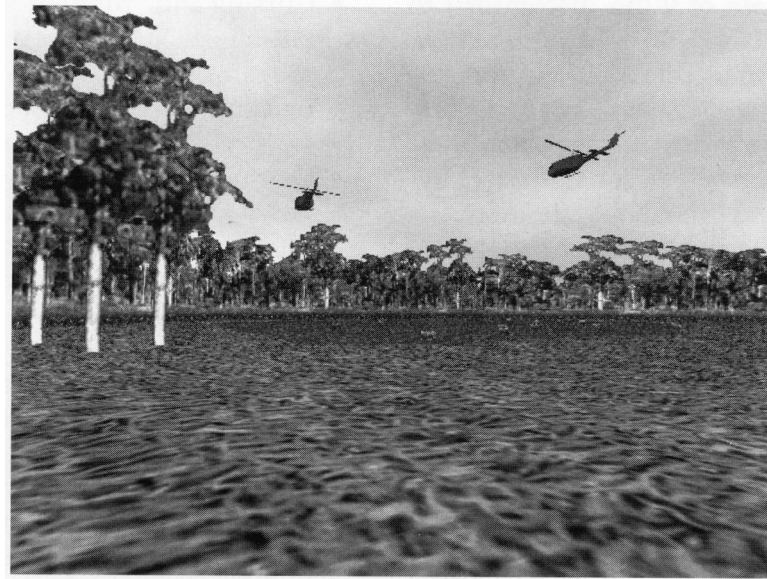
FIG. 2. Open field environment.

control of the therapist. Accompanying the visual stimuli are a number of audio effects that include the sounds of the helicopter, machine guns, background rumble of B52s, explosions, and radio chatter, all of which are also controlled by the therapist.