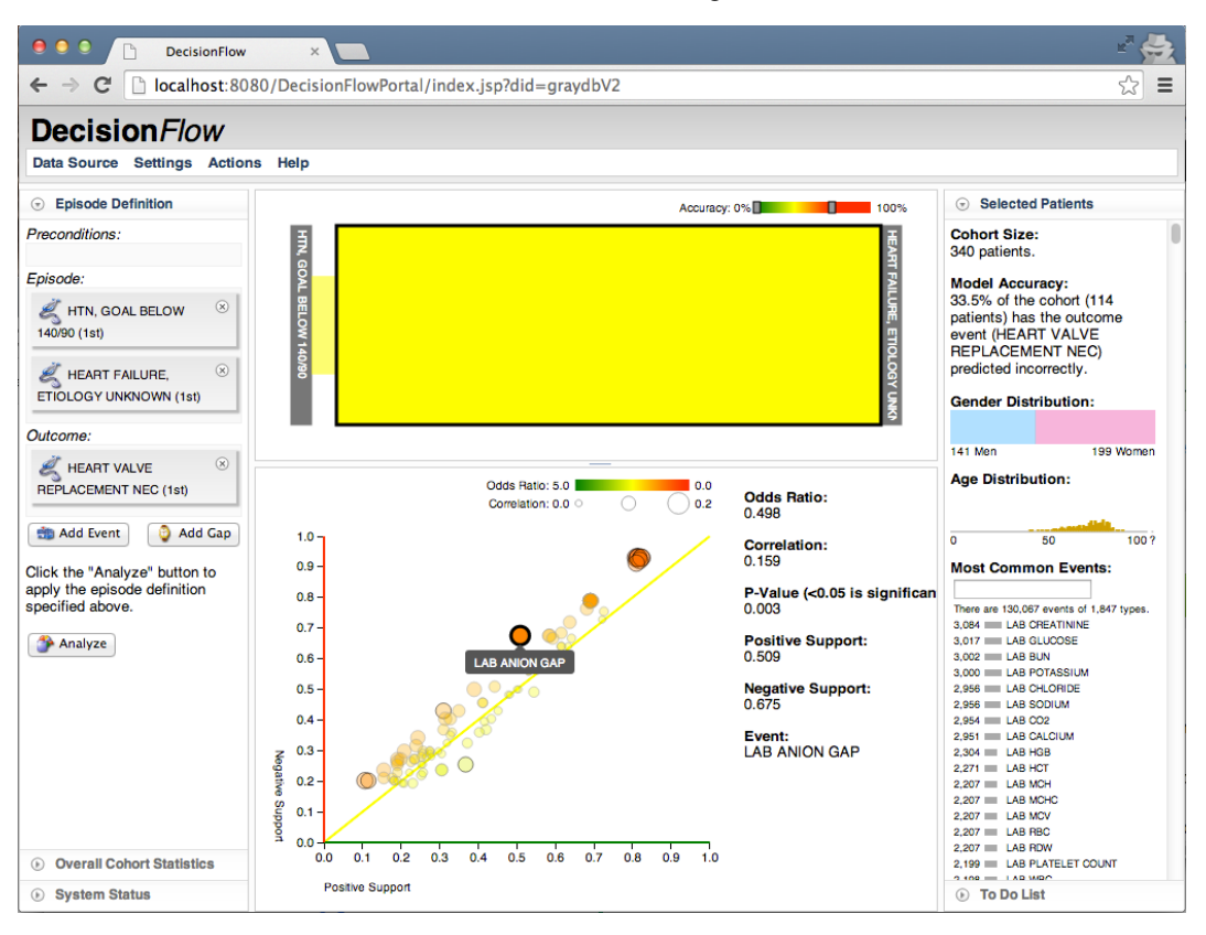
Fig. 1. This screenshot shows a modified version of a temporal event sequence visualization called DecisionFlow [2]. It has been connected with a predictive modeling platform [4] and updated to visually integrate model accuracy data. It supports the identification of event types that are highly correlated with incorrect predictions, and subgroups of the data that are poorly predicted. This provides model developers with a powerful set of tools for understanding erroneous predictions, identifying problems with predictive models, and eventually developing more targeted and precise models that improve overall accuracy.

Abstract — Visualization methods have traditionally focused on visualizing retrospective data, often with the goal of helping users identify data attributes with strong associations to specific outcomes of interest. This can be very helpful during various stages of predictive model development including feature selection, feature construction, and model configuration. While less studied, visualization can also be a powerful tool in the steps that come after a model has been trained: validation and refinement. This paper describes our preliminary work exploring the use of interactive visualization for two specific validation and refinement tasks. In particular, we focus on (1) the visual identification of features associated with incorrect predictions, and (2) visual cohort segmentation to support the development of more targeted predictive models for poorly predicted sub-populations.